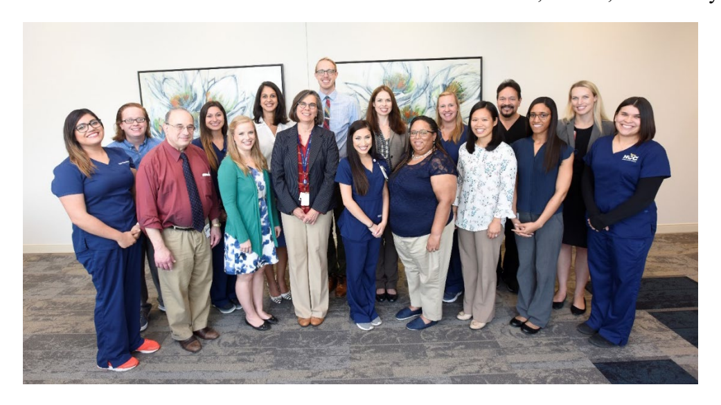
The Transition Medicine Team poses in the waiting room of the clinic, located at the McNair Campus.

• The Society for Pediatric Dermatology 44th Annual Meeting, Transition from Pediatric to Adult Health Care: Follow the Yellow Brick Road, Austin, Texas. July 13, 2019