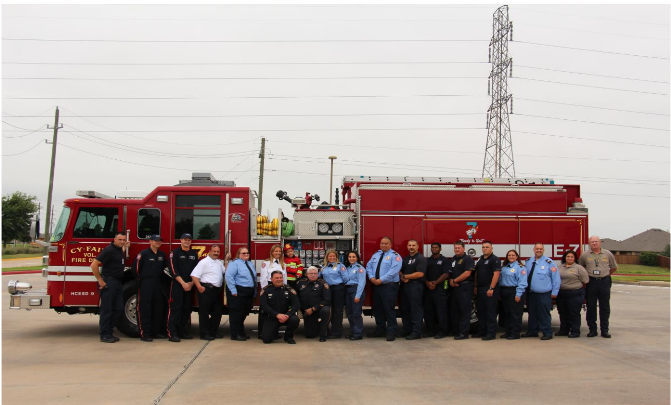
2015 EMS for Children Crew of the Year Award Recipients: Members of the Cy-Fair Volunteer Fire Department, Memorial Hermann Life Flight, and the Harris County Sheriff's Department

Program Manager EMSC State Partnership, Texas 1102 Bates Ave, Suite 1850 Houston, TX. 77030