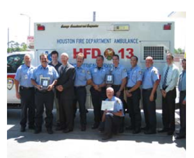
2009 EMSC Crew of the Year

The Deadline for nominations is April 15, 2010.