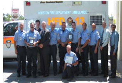
EMSC Crew of the Year, 2009