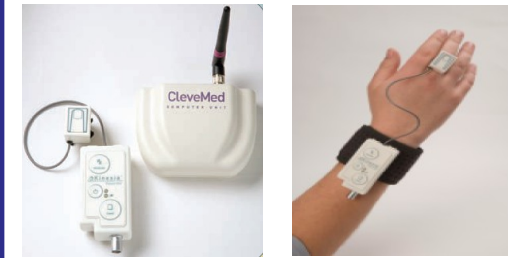
Fig.1. Kinesia™ wireless system (QMAS) and video-guided tasks:

Twelve ET subjects were enrolled (age: 50.25 ± 20.58 years; age at onset: 32 ± 21.66 years). TETRAS scores for upper limbs postural (arms outstretched) and kinetic tremor were respectively 1.71 ± 0.45 and 1.79 ± 0.5. For each time-interval of assessment, QMAS and video scores were directly correlated and they showed good intra-rater reliability (see tab. 1 and tab. 2).