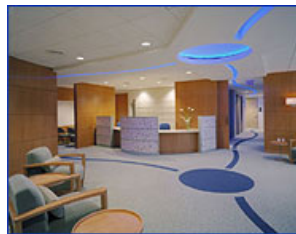
Reception area of the Maxine Mesinger MS Clinic