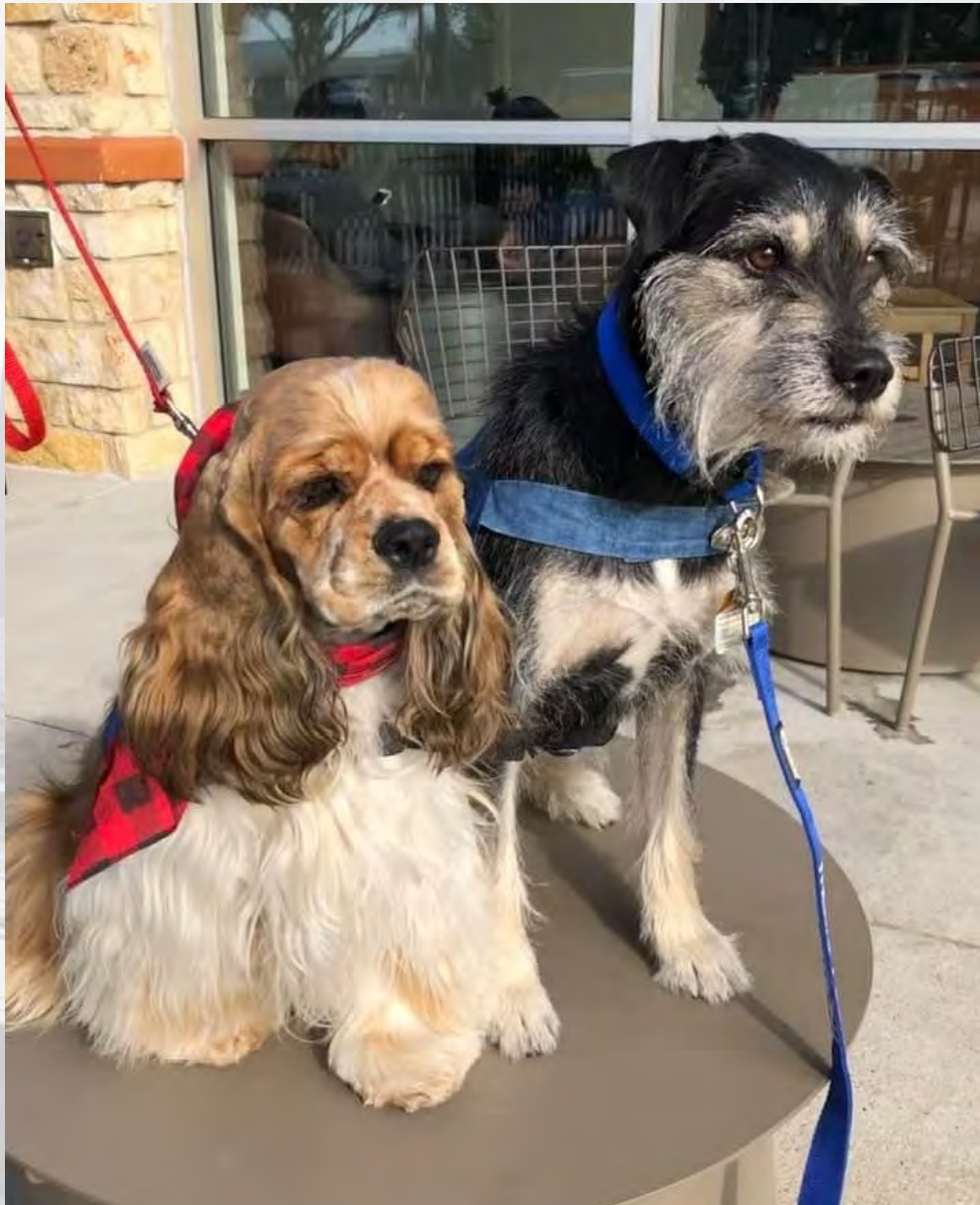
“Lady & the Tramp” aka

Belle (D&D Borden’s Lady Plurabelle of the Liffey) & Omri AKC Canine Good Citizens – Licensed Pet Therapy Dogs